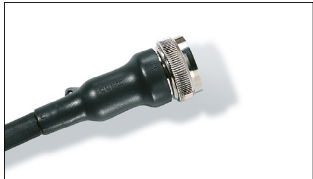
150 serie krympet på konnektor.