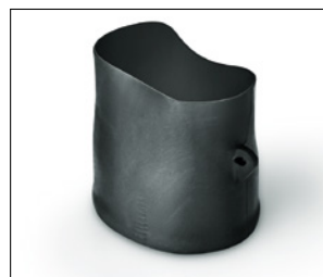
Serie 150 ukrympet.