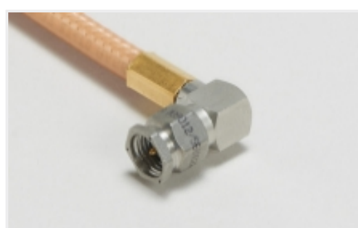
RF Cable Assemblies(25)