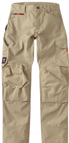
■ 1470 SAND