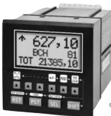
9100 IN COUNTER MODE

The versatile 9100 multi-function instrument is a multi-preset, totalising, batch counter with Device Net/CAN and back-lit display