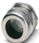
Metal screw connection up to 5 bar, thread length: 8 mm, cable diameter: 19 - 27 mm, WAF 43, screw connection: M32

Cable gland - HC-M-KV-M32(19-27) - 1646010