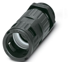
Cable gland, metric thread, IP68/69k protection, with strain relief

https://www.phoenixcontact.com/in/products/3240942