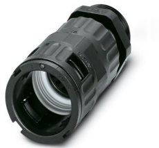
Cable gland, Pg thread, IP66 protection, with strain relief

https://www.phoenixcontact.com/in/products/3240948