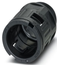
Cable gland, Pg thread, IP66 protection, straight

https://www.phoenixcontact.com/in/products/3240892