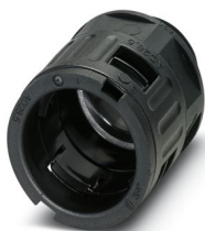
Cable gland, metric thread, IP66 protection, straight

https://www.phoenixcontact.com/in/products/3240899