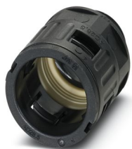
Cable gland, metric thread, IP68/69k protection, straight

https://www.phoenixcontact.com/in/products/3240885