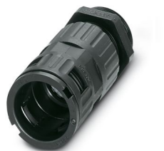
Cable gland, metric thread, IP66 protection, with strain relief

https://www.phoenixcontact.com/in/products/3240956