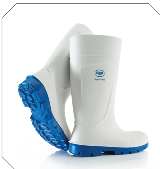
Steplite® Food white - ref. P2100/1053 (O4) ref. P2300/1053 (S4)