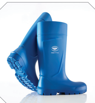
Steplite® Food blue - ref. P2300/5353