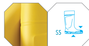
Also available in yellow ref. P2400/2080