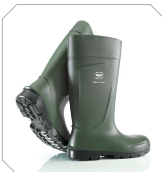
Steplite® Food green - ref. P2300/9180