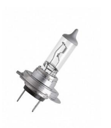
H3 Halogen Lamp 24v 70 wat