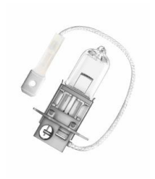
H3 Halogen Lamp 12v 55 watts