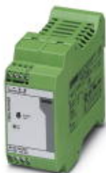
Primary-switched MINI POWER power supply for DIN rail mounting, input: 1-phase, output: 24 V DC/2 A

Please be informed that the data shown in this PDF Document is generated from our Online Catalog. Please find the complete data in the user's documentation. Our General Terms of Use for Downloads are valid ( http://phoenixcontact.com/download )