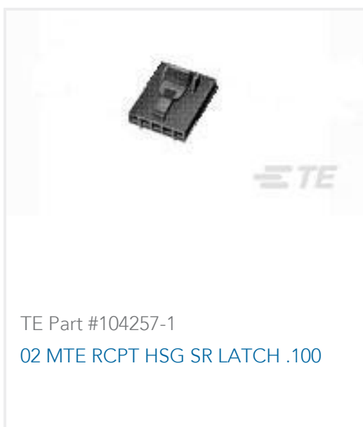
TE Part #104257-1 02 MTE RCPT HSG SR LATCH .100