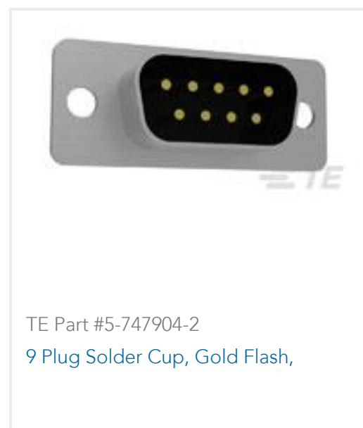
TE Part #5-747904-2 9 Plug Solder Cup, Gold Flash,