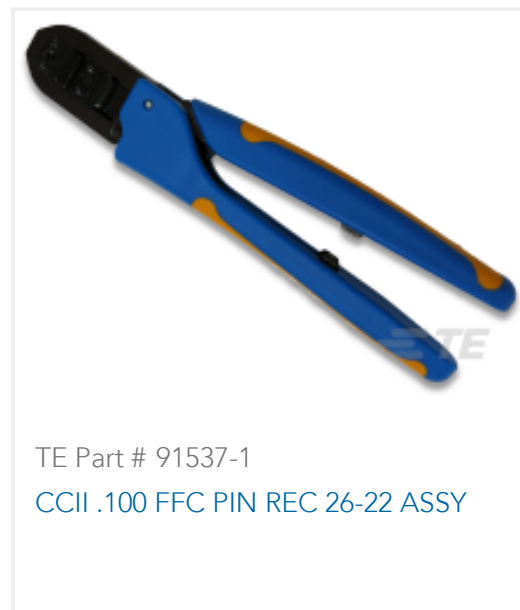
TE Part # 91537-1 CCII .100 FFC PIN REC 26-22 ASSY