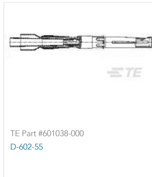
TE Part #601038-000 D-602-55