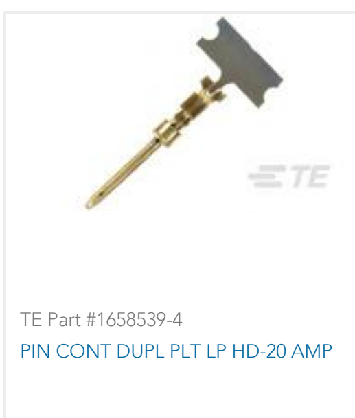
TE Part #1658539-4 PIN CONT DUPL PLT LP HD-20 AMP