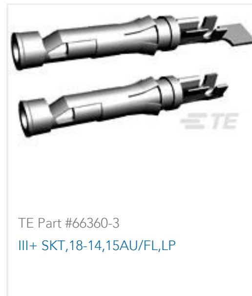
TE Part #66360-3 III+ SKT,18-14,15AU/FL,LP