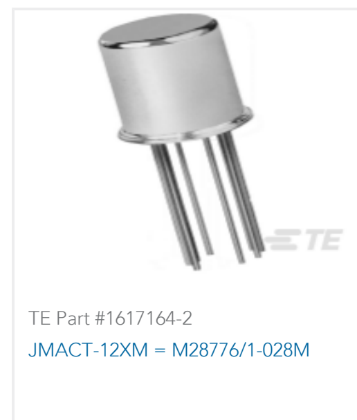
TE Part #1617164-2 JMACT-12XM = M28776/1-028M