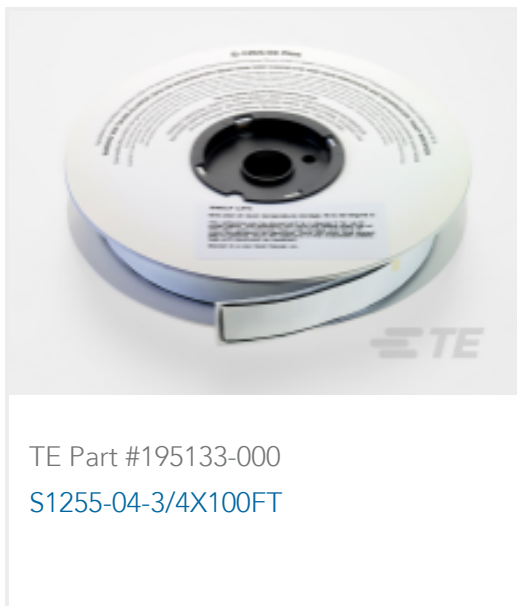
TE Part #195133-000 S1255-04-3/4X100FT