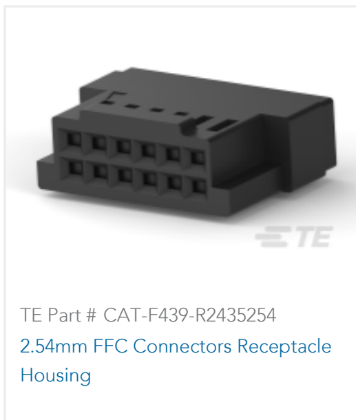
TE Part # CAT-F439-R2435254 2.54mm FFC Connectors Receptacle Housing