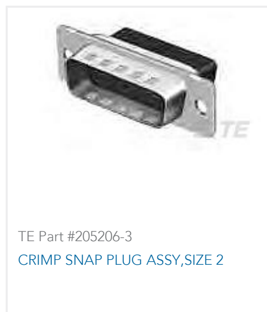
TE Part #205206-3 CRIMP SNAP PLUG ASSY,SIZE 2