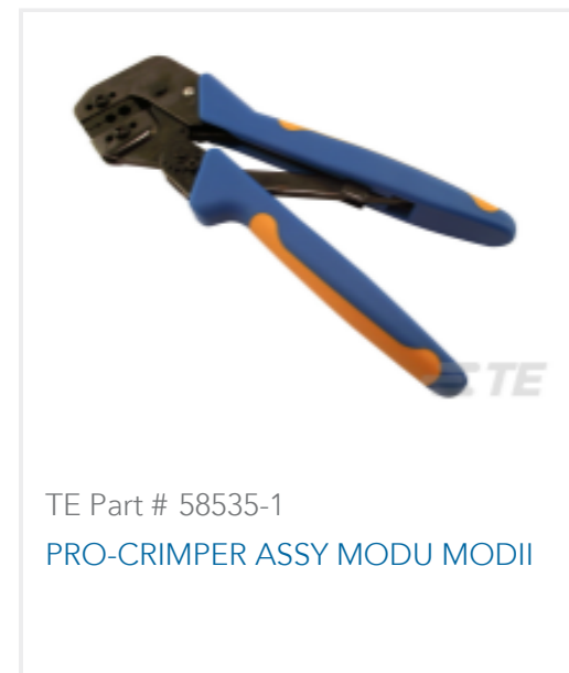
TE Part # 58535-1 PRO-CRIMPER ASSY MODU MODII