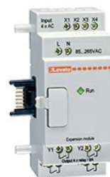
Micro PLC expansion module, 4 digital inputs + 4 relay outputs LRE08RA240 100...240VAC n° 4 digital N° 4 relay