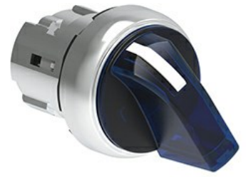
Illuminated selector switch actuator - 3 position LPSSL13