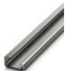
G-profile DIN rail, material: Steel, unperforated, height 15 mm, width 32 mm, length 2 m

DIN rail, unperforated - NS 32 UNPERF 2000MM - 1201015