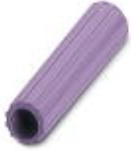
Insulating sleeve, Color: violet