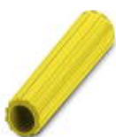
Insulating sleeve, Color: yellow