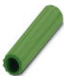
Insulating sleeve, Color: green