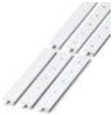
Zack marker strip, can be ordered: Strip, white, labeled according to customer specifications, Mounting type: Snap into tall marker groove, for terminal block width: 15.2 mm, Lettering field: 10.5 x 15.1 mm

Marker for terminal blocks - ZB 15,LGS:L1-N,PE - 0811998