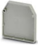
Separating plate, Width: 2 mm, Color: gray