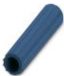
Insulating sleeve, Color: blue