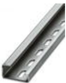
G-profile DIN rail, material: Steel, perforated, height 15 mm, width 32 mm, length 2 m

DIN rail perforated - NS 32 PERF 2000MM - 1201002