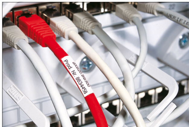
Self-laminating labels offer an excellent protection against abrasion and environmental impact.