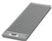
Plastic magazine for CMS-P1 plotter. Accepts 22 Zack band strips