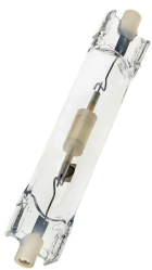
HMC150830TD/01 MASTERC CDM-TD 150W/830 RX7s