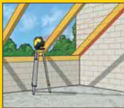
Angles and slopes