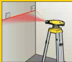
Horizontal & vertical levelling & alignment