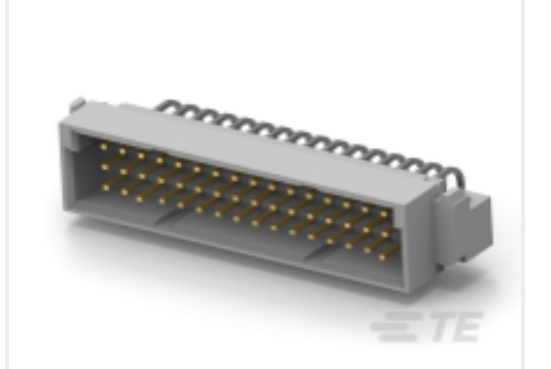
TE Part #148714-1 ASSY,PIN,EURO, "C/2",L-FREE,