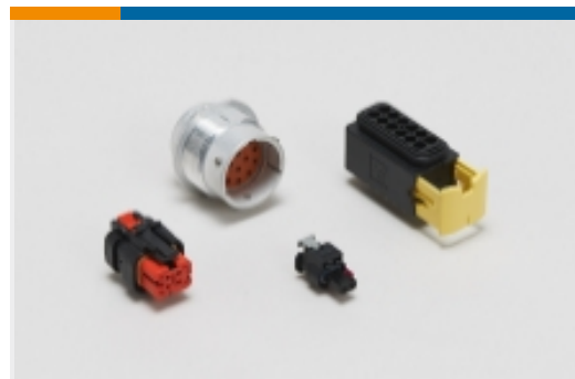
Automotive, Truck, Bus, & Off-Road Housings(189)