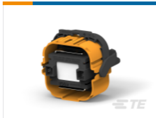
TE Model / Part #2315855-4 MSD, REC HSG ASSY, 450A, V0, M8