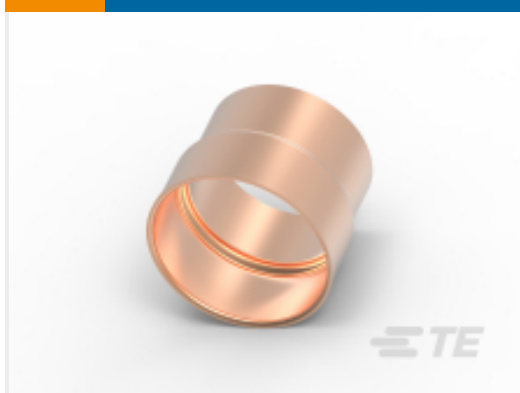
TE Model / Part #9-2141157-1 SHIELD CRIMP FERRULE, 90DEG