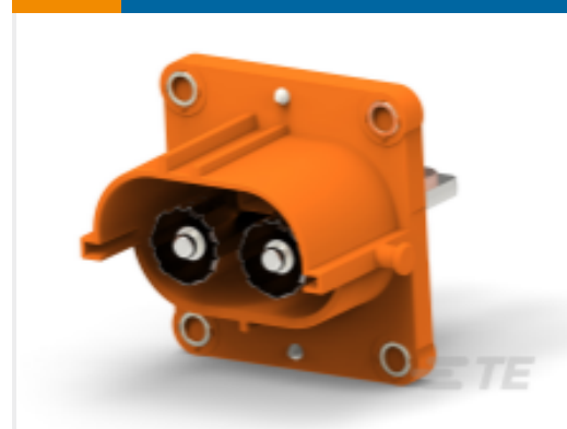
TE Model / Part #1-2322122-2 HVP800 2P HEADER ASSY