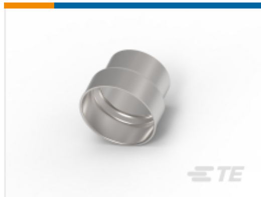
TE Model / Part #2177090-1 STEEL, OUTER FERRULE, 8MM HV, 50SQMM