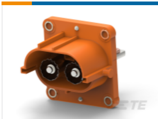
TE Model / Part #2-2322122-1 HVP800 2P HEADER ASSY