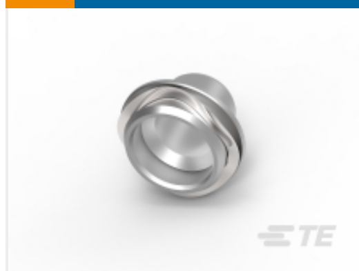
TE Model / Part #2141809-3 CONTACT KIT, BODY AND SPRING,