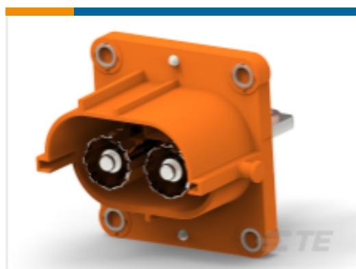
TE Model / Part #5-2322122-1 HVP800 2P HEADER ASSY