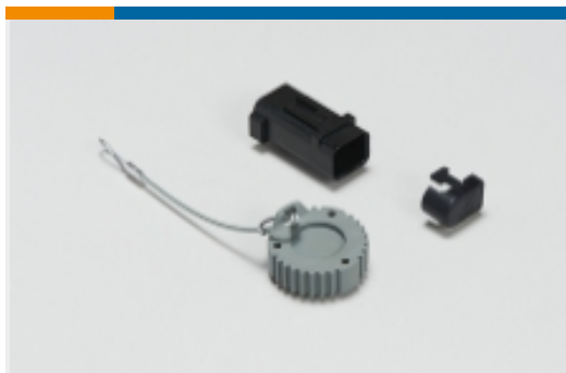
Automotive Connector Caps & Covers(19)