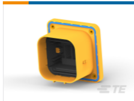
TE Model / Part #2315855-6 MSD, REC HSG ASSY, 630A, V0, M8