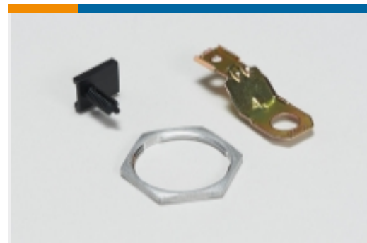
Other Automotive Connector Accessories(22)