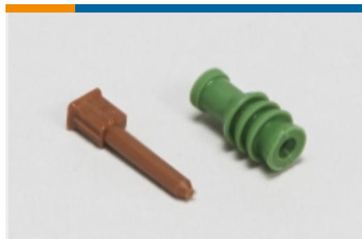
Automotive Seals & Cavity Plugs(1)