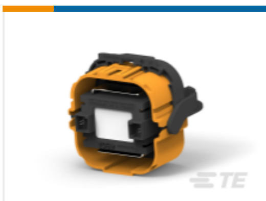
TE Model / Part #2315856-4 MSD, PLUG HSG ASSY, 450A, V0