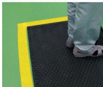
In the division of work space

※ Only when used in conjunction with a conductive color mat.