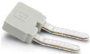
The figure shows the 2-position version

Insertion bridge, fully insulated, for connectors with 5.0 or 5.08 mm pitch, no. of positions: 6