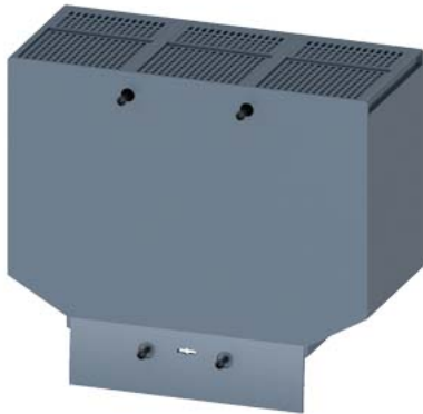
terminal cover offset for plug-in and draw-out socket accessory for: circuit breaker, 3-pole 3VA1 400/630 3VA2 400/630