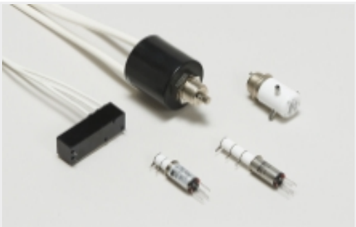
High Voltage Relays(18)