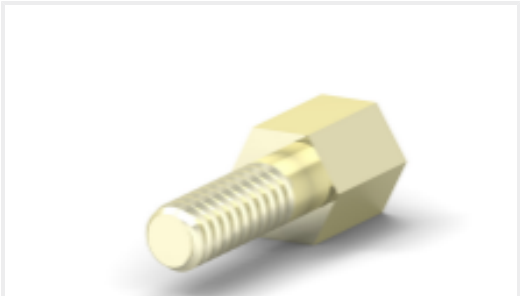
TE Part #1393560-5 C42334A 383C911=SUB D BOLZEN A