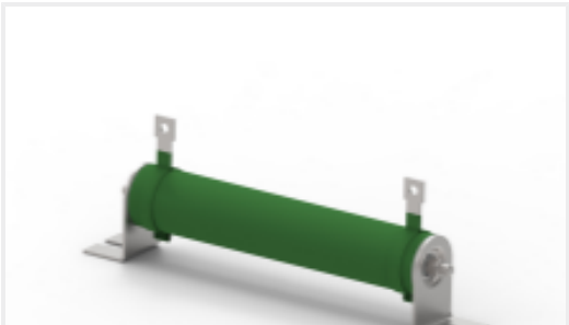
TE Part #5-1879443-5 TE 80W 2K7 5% Bracket