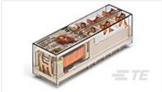
TE Part #1393260-4 SR6B4012 - V23050-A1012-A542