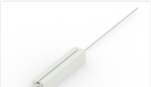
TE Part #CAT-C339-SB19B Wirewound Resistor: Vertical Mount