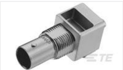
TE Part #5227677-1 BNC PCB RT ANG JACK W/POST