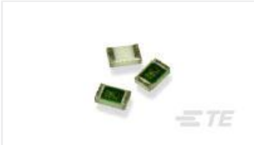
TE Part #1879338-6 CPF 0603 30K1 1% 50PPM 1K RL