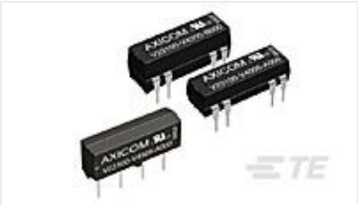
TE Part #3-1393763-2 V23100V4315B000