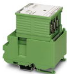
The photo shows the complete module

Replacement module electronics for IBS ST (ZF) 24 BK RB-T