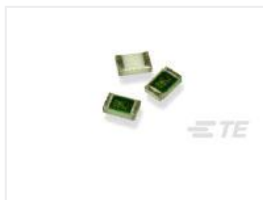
TE Part #4-1879214-3 CPF 0402 909R 0.1% 25PPM 1K RL