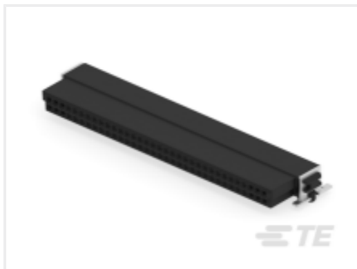
TE Part #154743-E SMCQ 68 F AB VV 7-03 CL * 0007 137 E002