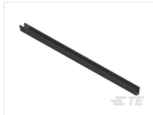
TE Part #7574444009 RAYRIM-NR8-0-SP