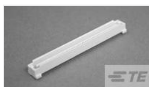
TE Part #5177984-2 0.8FH,P05H.5,060,08/Sn,TU