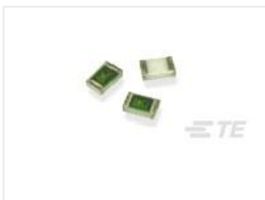
TE Part #1614352-2 RN 0603 20K 0.1% 10PPM CUT LEN