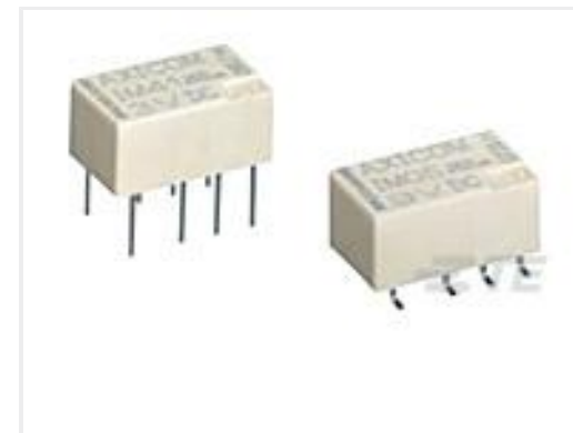
TE Part #1462039-2 IM07CGR=IM RELAY 200mW 24V HDV