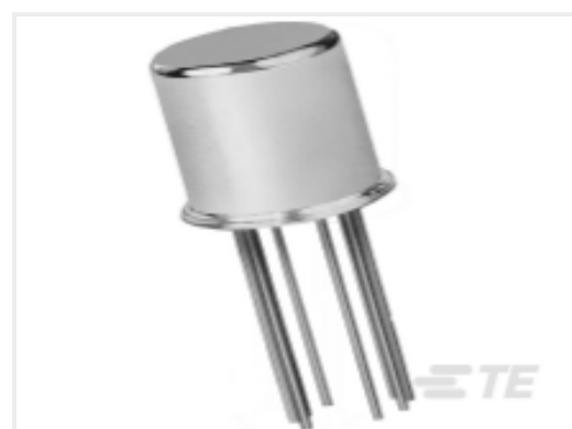
TE Part #5-1617819-3 PRMACD-12XS2 = PRMAD COTS .100