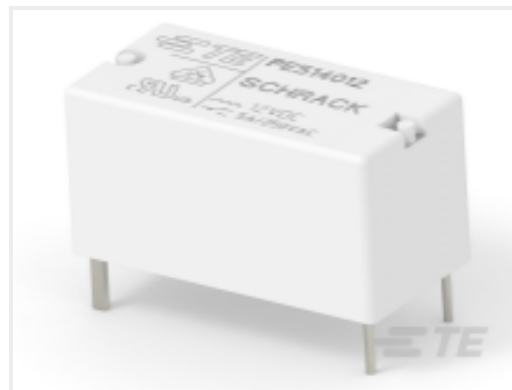
TE Part #2-1393219-0 PE514012