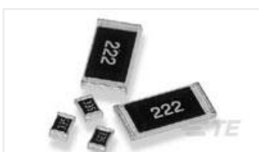
TE Part #2-2176177-2 CRGH0603 1% 8K2 0.2W