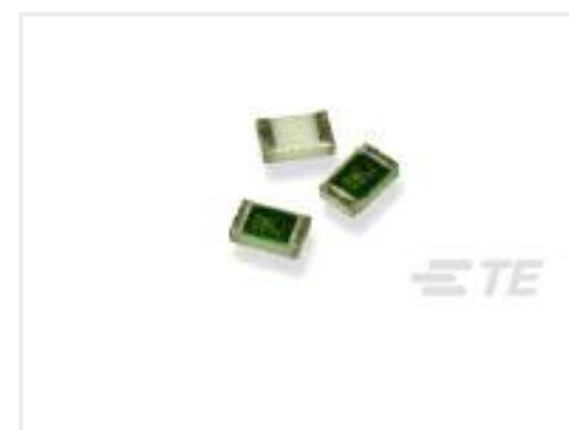
TE Part #3-1879215-1 CPF 0402 8K45 0.1% 25PPM 1K RL