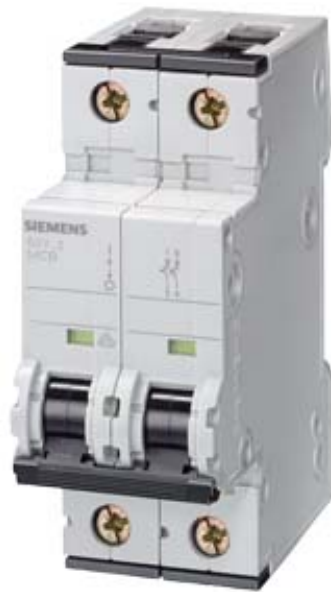
CIRCUIT BREAKER 230V 10KA, 1+N-POLE, B, 25A, D=70MM