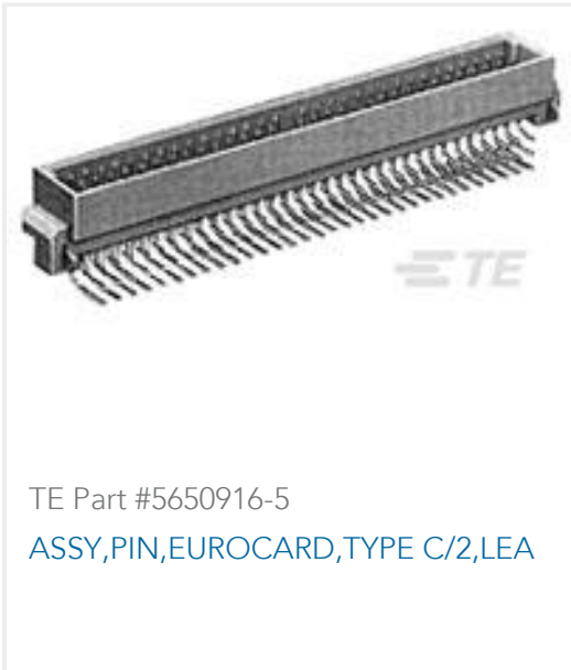
TE Part #5650916-5 ASSY,PIN,EUROCARD,TYPE C/2,LEA