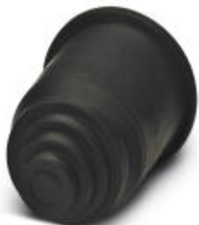
End sleeves, transition sleeves, from hose to cable

Please be informed that the data shown in this PDF Document is generated from our Online Catalog. Please find the complete data in the user's documentation. Our General Terms of Use for Downloads are valid ( http://phoenixcontact.com/download )