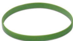
Color coding, color: green

https://www.phoenixcontact.com/in/products/1620588