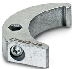
Hook wrench, series: RC, UC, RF, SF

https://www.phoenixcontact.com/in/products/1607455