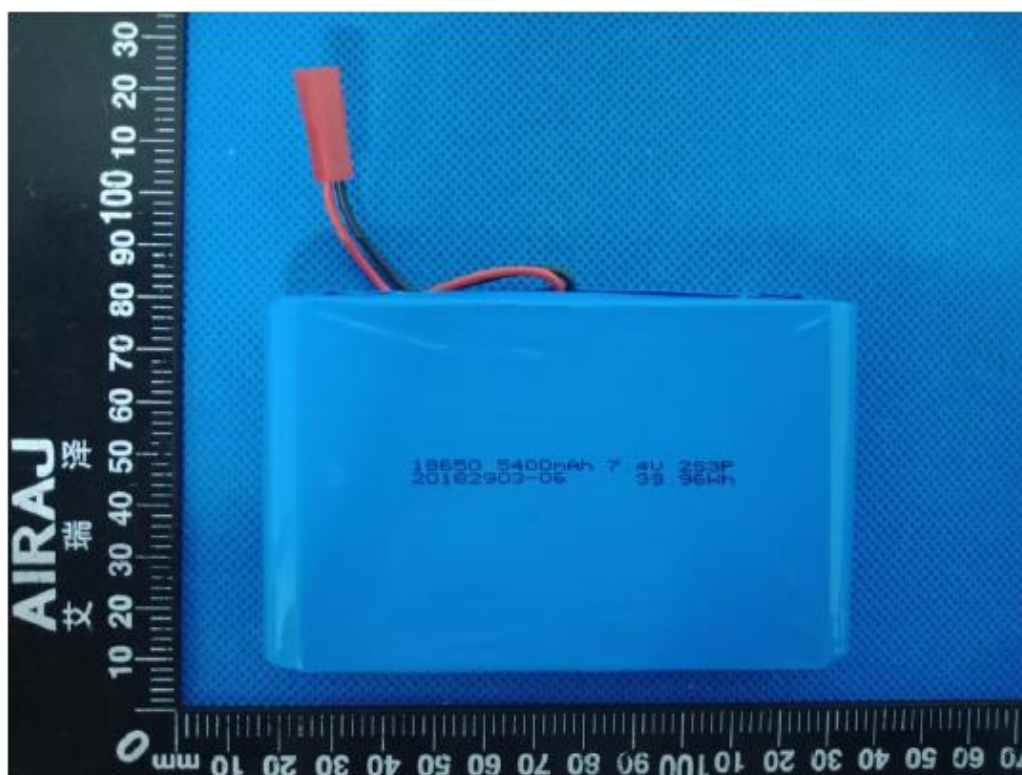
Figure 1 Front view of battery pack