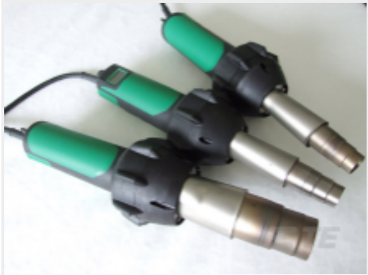
TE Part # EG1114-000 CV1981-ST-230V1600W-EU

numbers that TE has identified as EU ELV compliant have a maximum concentration of 0.1% by weight in homogenous materials for lead, hexavalent chromium, and mercury, and 0.01% for cadmium, or qualify for an exemption to these limits as defined in the Annexes of Directive 2000/53/EC (ELV). Regarding the REACH Regulation, the information TE provides on SVHC in articles for this part number is based on the latest European Chemicals Agency (ECHA) ‘Guidance on requirements for substances in articles’ posted at this URL: https://echa.europa.eu/guidance-documents/guidance-on-reach