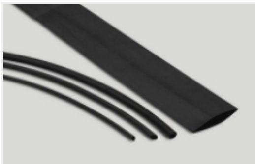
Single Wall Tubing(139)