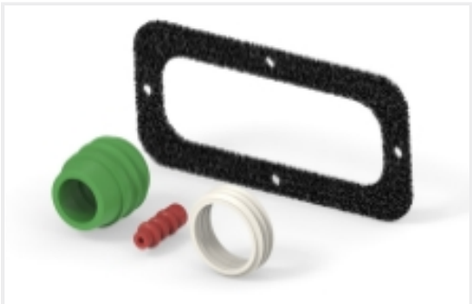
Connector Seals & Cavity Plugs(35)