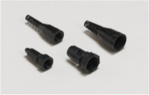
Connector Strain Relief(60)