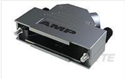
TE Part #1-1478763-5 METAL BACKSHELL 15 WAY 45 DE