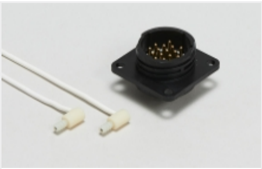
Circular Power Connectors(10)