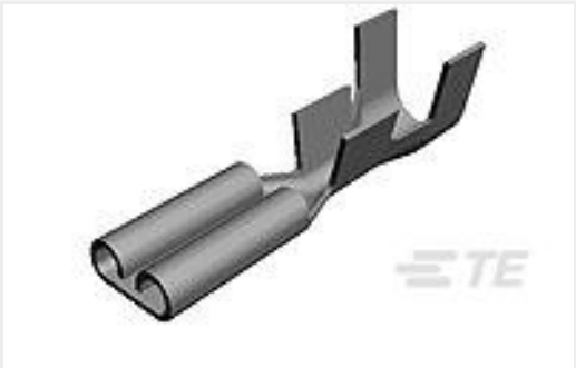
TE Part #140719-2 110 FASTON,REC.,22-18 AWG,TPBR