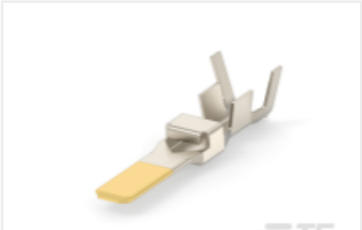
TE Part #CAT-D9934-A83 Contact: Component To Wire ; 20-45A , 20-8 wire size