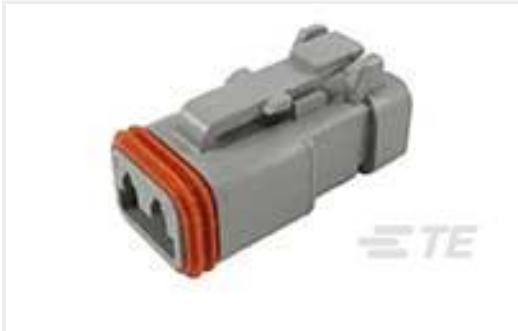
TE Part #DT06-2S-EP04 PLG, 2P, GRY, N, CAP