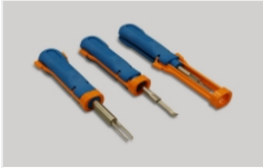
Insertion & Extraction Tools(1)