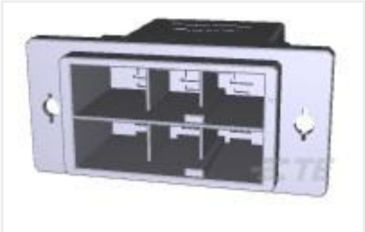
TE Part #1-917809-3 DYNAMIC D-5 TAB HSG D/R 6P X-X