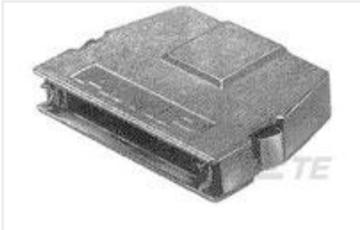
TE Part #5749195-2 68 50SR KIT,ST,UK