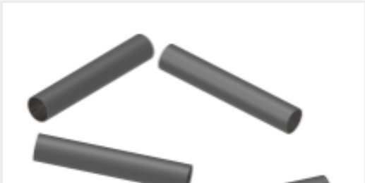
TE Part #NB25962001 SCL-1/4-0-STK