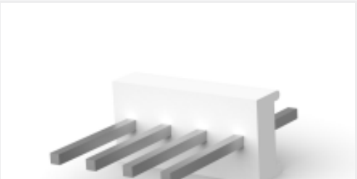
TE Part #CAT-104MTA-PVUNH PCB Header: Polyester, Vertical, Unshrouded, No Mating Alignment