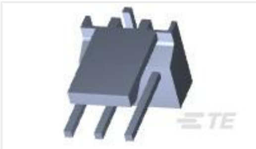
TE Part #3-647168-3 03P MTA100 HDR ASSY SM 30AU LF