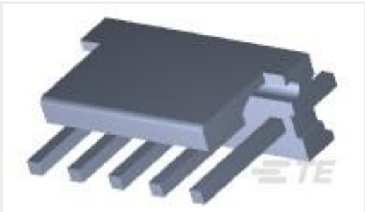
TE Part #3-641119-5 05P MTA156 HDR ASSY FL/ST LF