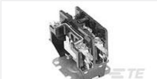
TE Part #1-1611001-9 3100-15T2999=30A 1PWS 120V PRO