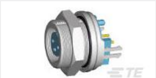
TE Part #7-1437719-2 T01-0570-S05-FEMALE REC PANEL-PCB STRT