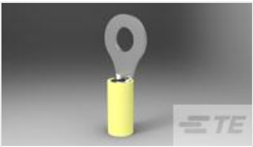
TE Part #165034 PIDG RING 12-10 1/4