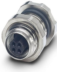
Device connector rear mounting, 4-position, Socket, straight, M5, coding: A, Rear mounting, M7, Solder pins

Please be informed that the data shown in this PDF document is generated from our online catalog. Please find the complete data in the user documentation. Our general terms of use for downloads are valid.