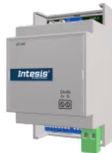
Mitsubishi Electric Domestic to Modbus - 1 indoor unit

The Mitsubishi Electric-Modbus interface allows full bidirectional communication between Mitsubishi Electric Domestic, Mr. Slim, and City Multi air conditioner units and Modbus RTU (RS-485) networks. The interface acts as a server device for the installation, accessing all signals from the air conditioner unit.