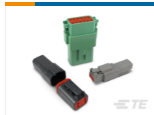
TE Model / Part #DT06-2S-C015 DEUTSCH DT HOUSINGS