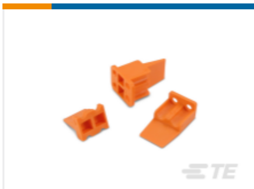
TE Model / Part #WP-4S DEUTSCH DTP WEDGELOCKS