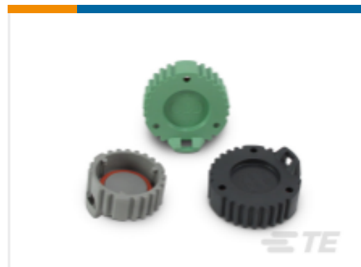
TE Model / Part #HDC16-9 DEUTSCH HD10 RECEPTACLE DUST CAPS