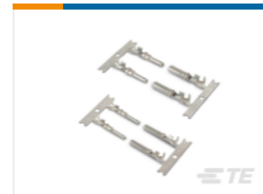
TE Model / Part #1060-12-0166 DEUTSCH STAMPED & FORMED CONTACTS