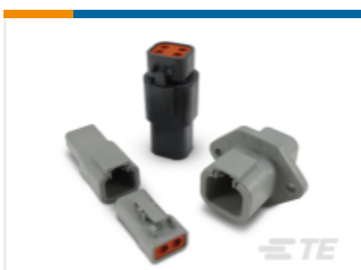
TE Model / Part #DTP06-4S DEUTSCH DTP HOUSINGS