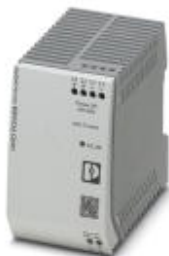
Primary-switched UNO POWER power supply for DIN rail mounting, input: 1-phase, output: 24 V DC/90 W

Please be informed that the data shown in this PDF Document is generated from our Online Catalog. Please find the complete data in the user's documentation. Our General Terms of Use for Downloads are valid ( http://phoenixcontact.com/download )