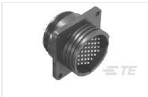
TE Part #208223-9 CPC RECPT ASSEMBLY SIZE 13-9