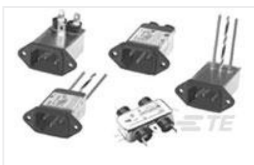
TE Part #6609013-5 10EH4=F7435 S0