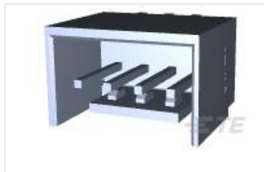
TE Part #3-644892-4 04P CST100 SHRD HDR ASSY LF