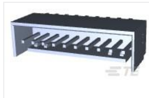
TE Part #4-644892-0 10P CST100 SHRD HDR ASSY LF