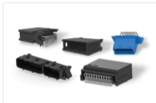
Automotive Signal & Power Headers(3)