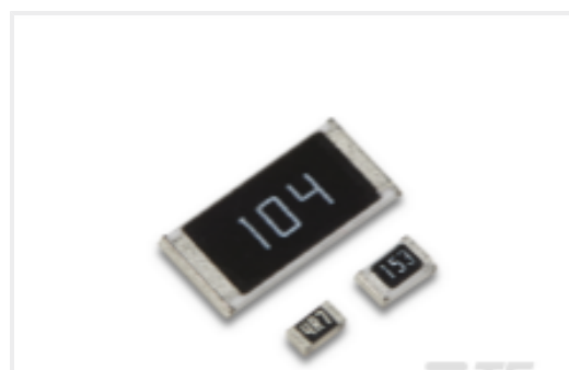
TE Part #1-2176341-9 CRGCQ 0805 330R 1%