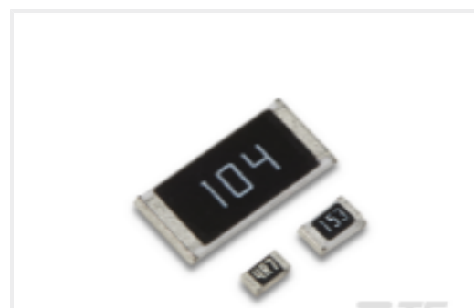
TE Part #2-2176341-3 CRGCQ 0805 680R 1%