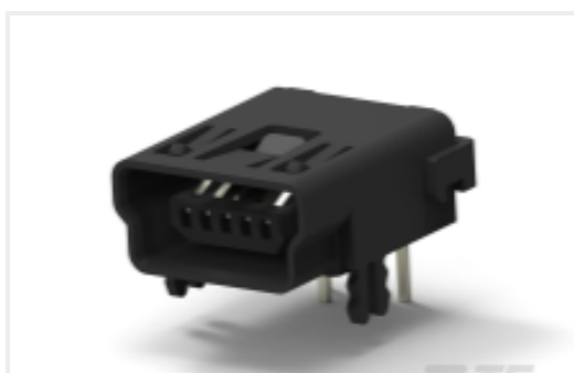
TE Part #1734510-1 MINI USB, TYPE B, R/A, T/H