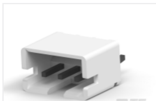
TE Part #CAT-H857-H34220 AMP HPI 2.0 mm Headers