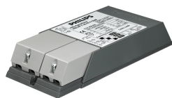
142634 HID-AV C 35-70 / I CDM 220- 240V 50/60Hz