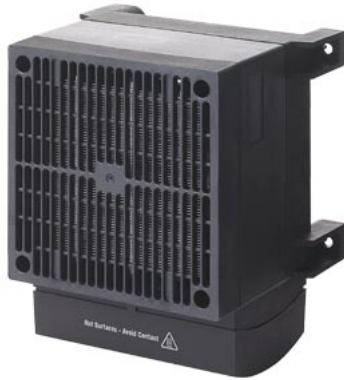
PTC without thermostat floor mounting fan heater CS030 120 V AC, 1200 W