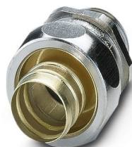
Cable gland made from brass with metric thread, IP65 protection

Please be informed that the data shown in this PDF document is generated from our online catalog. Please find the complete data in the user documentation. Our general terms of use for downloads are valid.