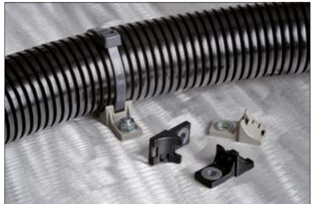
These HDM are suitable for assembling on screws.