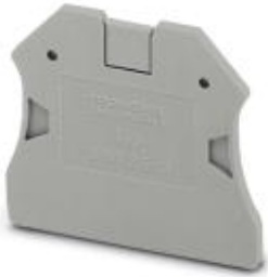
End cover, length: 47 mm, width: 2.2 mm, height: 39.8 mm, color: gray

Please be informed that the data shown in this PDF Document is generated from our Online Catalog. Please find the complete data in the user's documentation. Our General Terms of Use for Downloads are valid ( http://phoenixcontact.com/download )