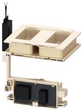
Magnet coil with switch-on electronics for contactor 3TF6844-.C., 110...132 V AC 50/60 Hz