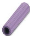
Insulating sleeve, Color: violet