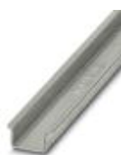
DIN rail, material: Steel, unperforated, 2.3 mm thick, height 15 mm, width 35 mm, length: 2 m

DIN rail, unperforated - NS 35/15-2,3 UNPERF 2000MM - 1201798