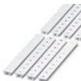
Zack marker strip, can be ordered: Strip, white, labeled according to customer specifications, Mounting type: Snap into tall marker groove, for terminal block width: 10.2 mm, Lettering field: 10.15 x 10.5 mm