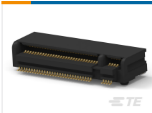
TE Model / Part #1-2199119-5 M.2 CONNECTORS