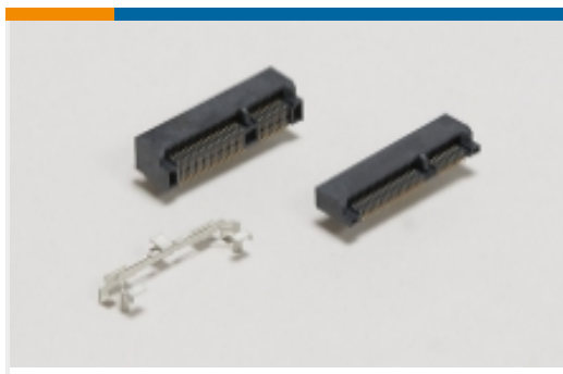
Mini PCI Express &amp; mSATA(6)