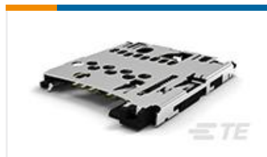
TE Model / Part #2201778-1 MICRO SD PUSH PUSH LOW PROFILE TYPE