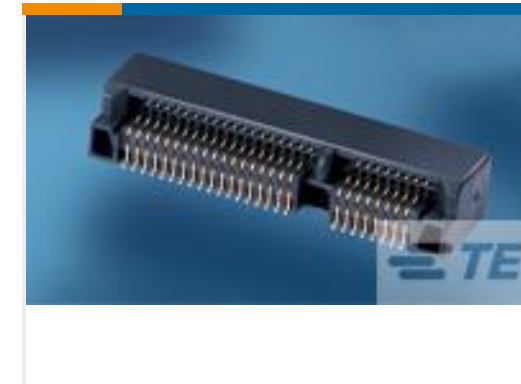
TE Model / Part #1775862-2 mSATA/mini PCI-E 5.2H Type I G/F