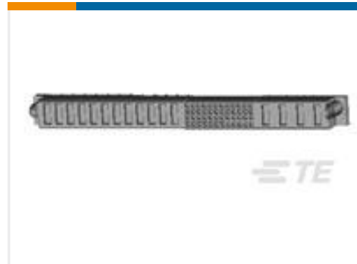
TE Model / Part #6450863-5 MBXLE VERT RCPT 7ACP