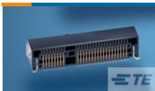
TE Model / Part #2041262-1 Mini PCI-E 6.8H G/F