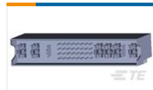
TE Model / Part #6450849-7 MBXLE R/A HED 2ACP+1LP+32S+3HDP+1LP+1P