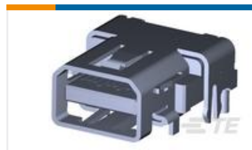
TE Model / Part #2129320-3 Mini Displayport Reverse Offset TYPE