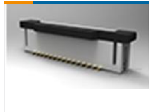
TE Model / Part #1-1734248-5 1.0 FPC, ZIF V/T, SMT, 15P