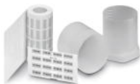
The figure shows the EML (15X9)R SR product variant

Label, Roll, silver/matt, unlabeled, can be labeled with: THERMOMARK ROLL, THERMOMARK ROLL X1, THERMOMARK X, THERMOMARK S1.1, Mounting type: Adhesive, Lettering field: 26.5 x 12 mm