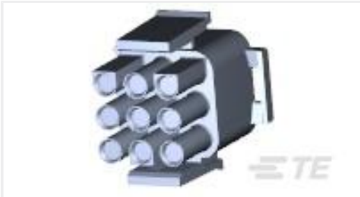
TE Part #350720-1 09P UMNL PLUG HSG