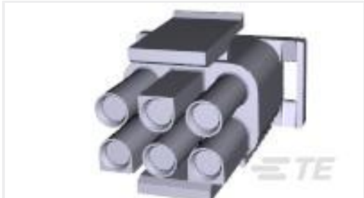
TE Part #350715-1 06P UMNL PLUG HSG