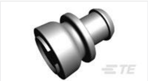
TE Part #828922-1 2,5MM CAVITY PLUG FOR 5,4MM DI