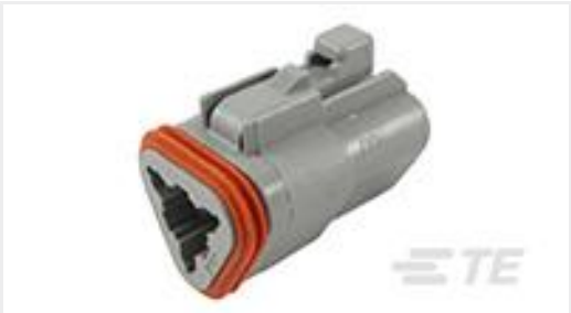
TE Part #DT06-3S-C015 PLG, 3P, GRY, E