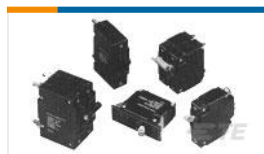
TE Part #7-1393252-7 W67-X2Q50-2=M6/M7/M9 /W6/W7