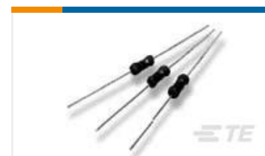
TE Part #1625881-2 1W STD M/OX 2% 220R