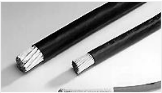
TE Part #7321453001 VG-95218-T024-K006