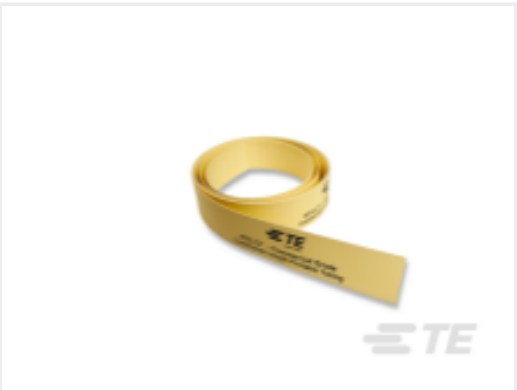
TE Part #CAT-C7679-R819 Continuous Tube Commercial Grade RPS-CT