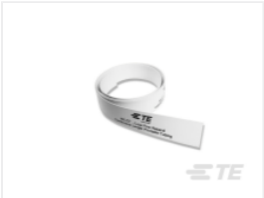
TE Part #EL8195-000 HX-CT-50M-3.2-OUT-9